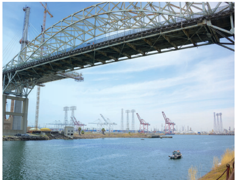
Spotter boat in place under the construction area for help with safe passage.

For watercraft approaching the Bridge Project from the north or south, Marine VHF radio channels 13 and 79 can be used to communicate with the spotter boat to determine safe passage. If you have any questions, please contact the Bridge Project Communications Team at 562.485.2780 or info@GDBRProject.com .