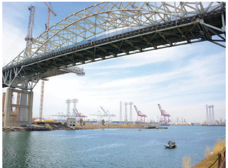
Spotter boat in place under the construction area for help with safe passage.

For watercraft approaching the Bridge Project from the north or south, Marine VHF radio channels 13 and 79 can be used to communicate with the spotter boat to determine safe passage. If you have any questions, please contact the Bridge Project Communications Team at 562.485.2780 or info@GDBRProject.com .