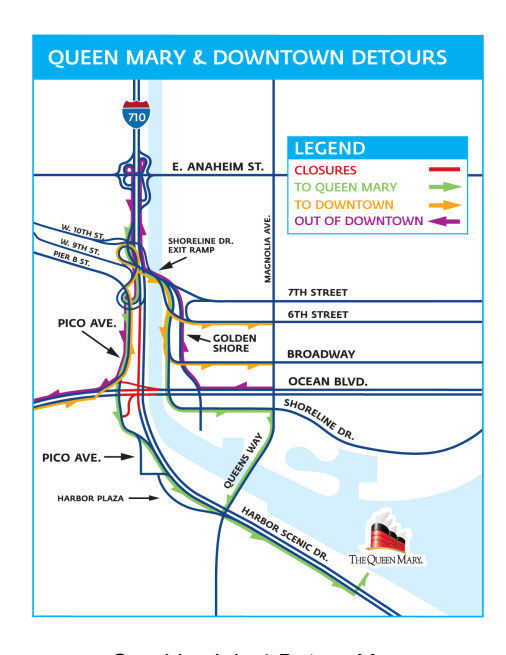
Graphic: July 4 Detour Map

During this 4-day closure, the westbound Ocean Blvd off-ramp to Pico Avenue and Pier E connector ramp to downtown Long Beach will be closed, too. If you are traveling east from Terminal Island into the city, exit at Pico Avenue, turn left headed north, turn right onto 9th Street, continue on 10th Street, then take the downtown on-ramp onto Shoreline Drive (see orange line on map).