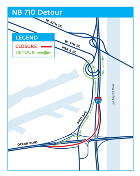
Graphic: NB I-710 Connector Permanent Detour Map

Reminder: On June 11, the NB I-710 connector ramp from eastbound Ocean Blvd will be permanently closed to enable construction of a new ramp. This map shows the detour route for any traffic heading northbound. Traffic heading east into downtown Long Beach will continue to use the current southbound Pico Avenue exit. For more information, please visit: <a href="https://bit.ly/2JYJOdQ">https://bit.ly/2JYJOdQ</a>