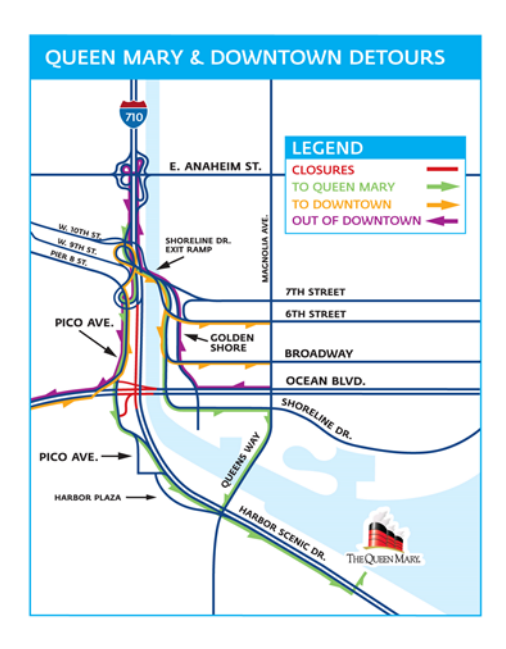
Graphic: July 4 Detour Map

To facilitate the demolition of the northbound I-710 connector ramp, southbound Harbor Scenic Drive, and the westbound Ocean Blvd off-ramp to Pico Avenue and Pier E connector ramp to downtown Long Beach, will be closed for four days only, from July 4-7, 2018. Several detour routes are recommended for motorists heading to the Queen Mary or downtown Long Beach during that time, which can be seen on this map, or described in detail on our website: <a href="https://bit.ly/2KuzJW8">https://bit.ly/2KuzJW8</a>