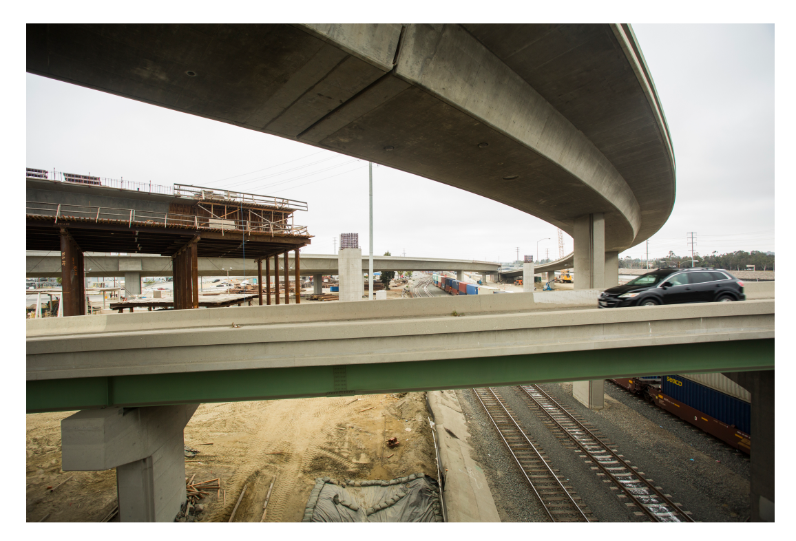
Graphic: NB I-710 Connector

June 11: Permanent closure of NB I-710 Connector Ramp July 4-7: Temporary closure of SB Harbor Scenic Drive, Ocean Blvd off-ramp to Pico Ave, and Pier E connector ramp to downtown Long Beach