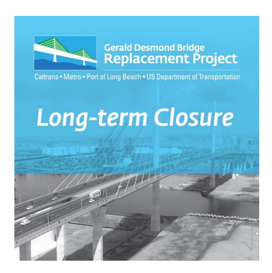
Graphic: Facebook and Instagram Closure Announcement

LONG-TERM CLOSURE: On June 11, the northbound I-710 connector ramp from eastbound Ocean Blvd will be permanently closed to enable construction of the new ramp. The detour will divert traffic to northbound Pico Ave. for approximately one-half mile before rejoining the northbound I-710 at Pier B/9th St. For more information, please visit: https://bit.ly/2JYJOdQ