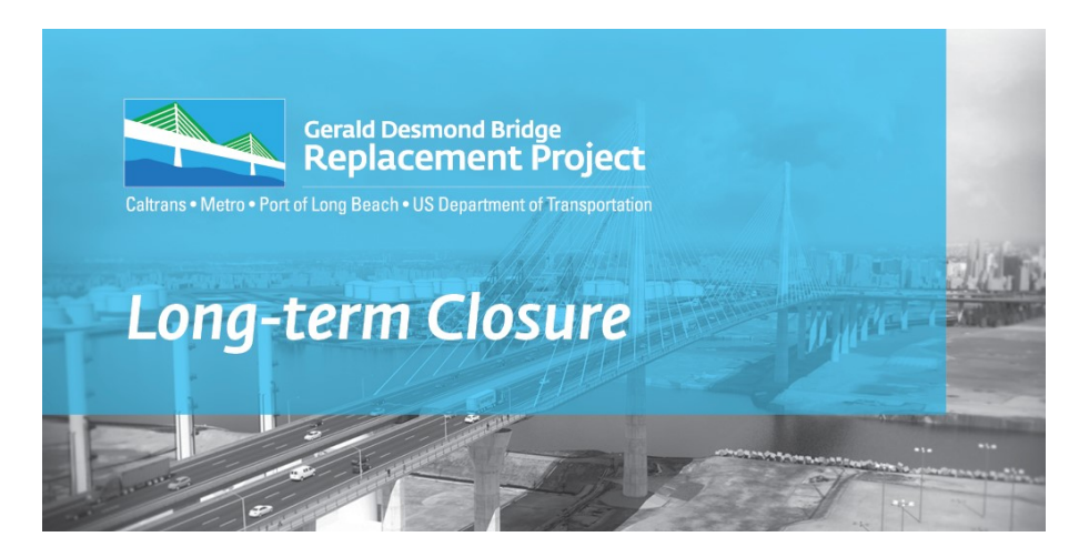
Graphic: Twitter Closure Announcement

On June 11, the NB I-710 connector ramp from EB Ocean Blvd will be permanently closed to enable construction of a new ramp. The detour will divert traffic to NB Pico Ave. for one-half mile before rejoining the NB I-710 at Pier B/9th St. For details, visit: https://bit.ly/2JYJOdQ