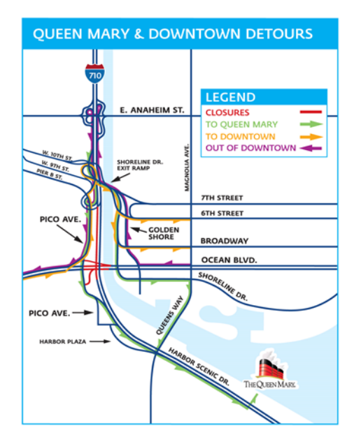
Graphic: July 4 Detour Map

To facilitate the demolition of the northbound I-710 connector ramp, southbound Harbor Scenic Drive, and the westbound Ocean Blvd off-ramp to Pico Avenue and Pier E connector ramp to downtown Long Beach, will be closed for four days only, from July 4-7, 2018. Several detour routes are recommended for motorists heading to the Queen Mary or downtown Long Beach during that time, which can be seen on this map, or described in detail on our website: https://bit.ly/2KuzJW8