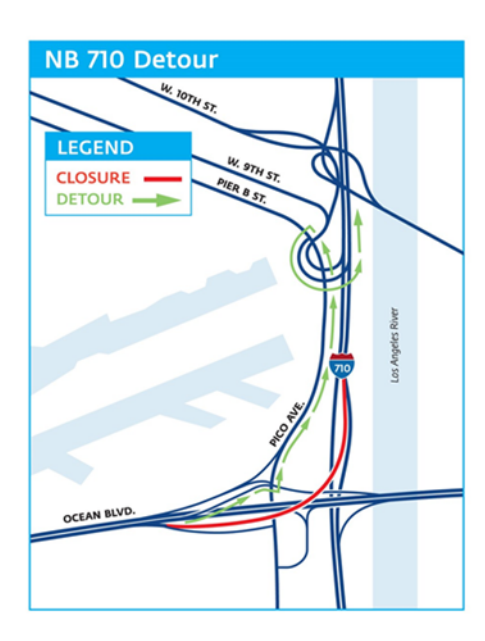
Graphic: NB I-710 Connector Permanent Detour Map

REMINDER: On June 11, the NB I-710 connector ramp from EB Ocean Blvd will be permanently closed. Traffic traveling on EB Ocean Boulevard that is headed to the NB I-710 will be diverted briefly onto surface streets – see map.