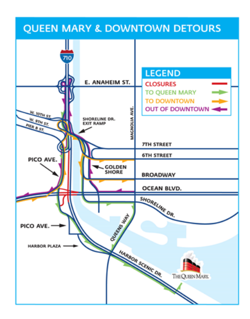
Graphic: July 4 Detour Map

To facilitate the demolition of the NB I-710 connector, SB Harbor Scenic, the WB Ocean Blvd off-ramp to Pico Ave, and the Pier E connector ramp to downtown Long Beach will be closed from 7/4-7/7. For detours to the Queen Mary or downtown Long Beach, visit: <a href="https://bit.ly/2KuzJW8">https://bit.ly/2KuzJW8</a>